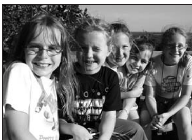
Campers at Horizon

Camp Lakeside's projects will receive $245,000 in distributions for projects at the camp site. The four bathrooms in the main Lodge have been completely redone, new carpeting was installed in