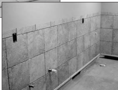
Baker Cabin tiled bathroom

the bedrooms and new windows were installed throughout the building. The cabinet doors in the kitchen also were replaced. Dirt was moved in and a new parking lot was completed behind the Lodge. Baker Cabin also was remodeled. The showers and restrooms were completely redone and privacy stalls were installed. In addition, a new closet was added and a new water heater was installed.