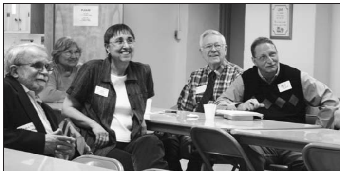
District rally event by the Center for Small Membership Churches