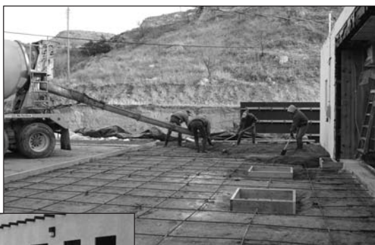
Dining hall and staff parking lot at Lakeside