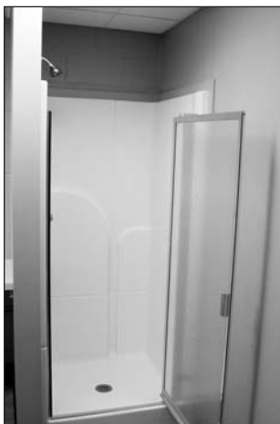
New bathrooms in the Protestant Campus Center at Fort Hays State University