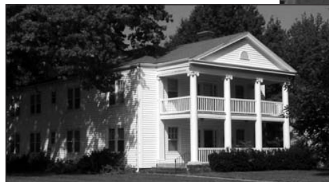
New campus ministry building at Washburn University.

K-State Wesley has purchased a building at the corner of Sunset Avenue and College Heights Road, just one block west of campus. The ministry received $200,000 from West's