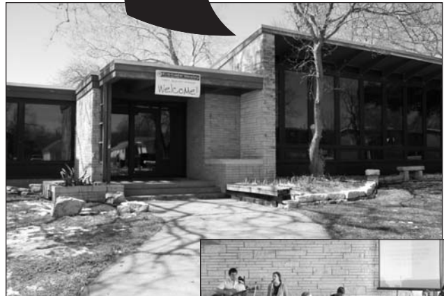
Consecration of the new K-State Wesley campus ministry building