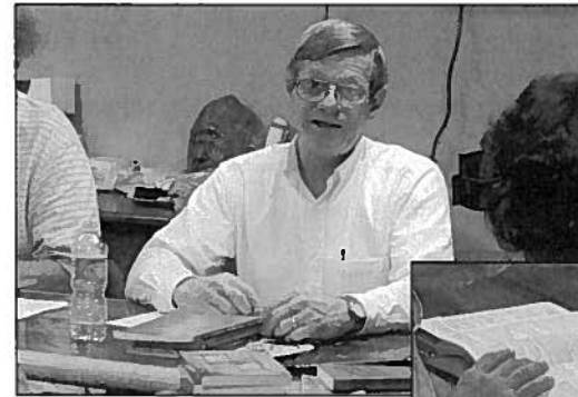
Unique partnership in Kansas City leads to Native American ministry.

Although Native American churches throughout the Midwest are part of the Oklahoma Indian Missionary Annual Conference, the congregations are scattered all over the region. The Kansas East and Kansas West annual conferences are both home to other Native American congregations. ■