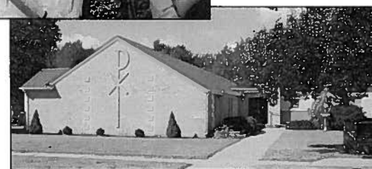
Alden United Methodist Church is in the Hutchinson District of Kansas West Conference.

Churches participating in the ABIDE program do pay a fee, but the majority of the cost is subsidized through support from the Kansas West Conference budget. The conference also pays for